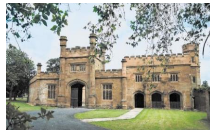
Stoneleigh Abbey Mews

After about 200m take the first left turn onto the B4115 signposted Ashow/Stoneleigh Abbey. Continue on the B4115 for about 1 mile until you reach the Stoneleigh Abbey entrance (gatehouse lodge pictured above) on the right. Turn right into the Abbey and continue along the drive towards the Abbey buildings. As you approach the Abbey you will see a car park signposted to the left. Turn into the car park and, if available, choose a parking bay at the far end (near to the exit) as this is nearest to the Stoneleigh Abbey Mews entrance. On foot, enter the Mews courtyard through the large arch. SCB Associates is the first entrance on the left of the courtyard.