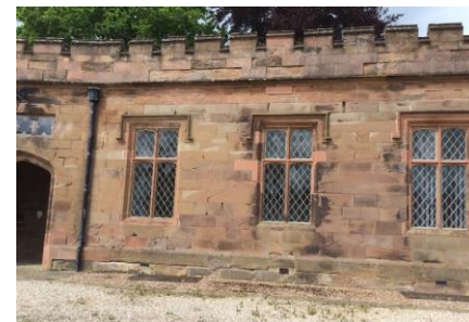
SCB Associates office

Please Note: – There is no access to Stoneleigh Abbey Mews from the B4113 or the NAEC show ground. Please do not follow your SatNav as this will probably take you the NAEC entrance.